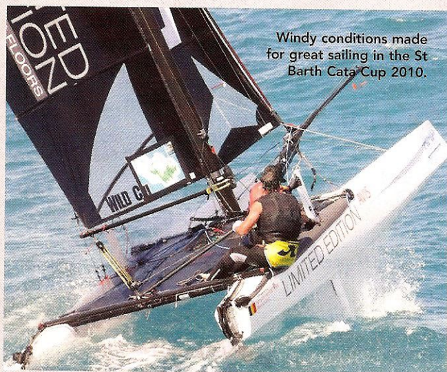
Windy conditions made for great sailing in the St Barth Cata Cup 2010.